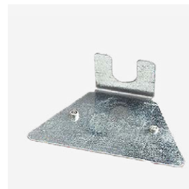
GALVANISED STEEL PLATE