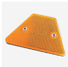
HIGHLY REFLECTIVE PMMA REFLECTOR