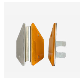
SINGLE OR DOUBLE-SIDED VERSIONS