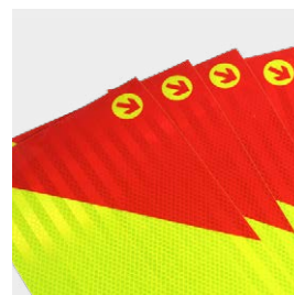
HIGHLY REFLECTIVE SHEETINGS