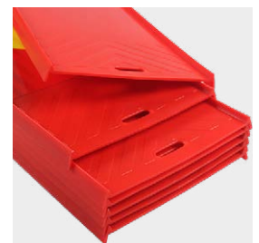
SAVE PACKING STORAGE