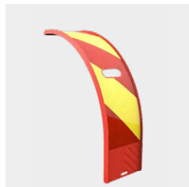
MADE OF POLYPROPYLENE