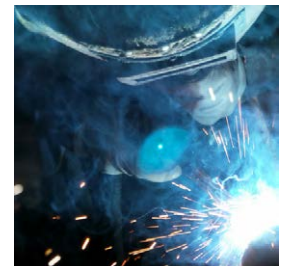
SEAMLESS, STRONG WELD